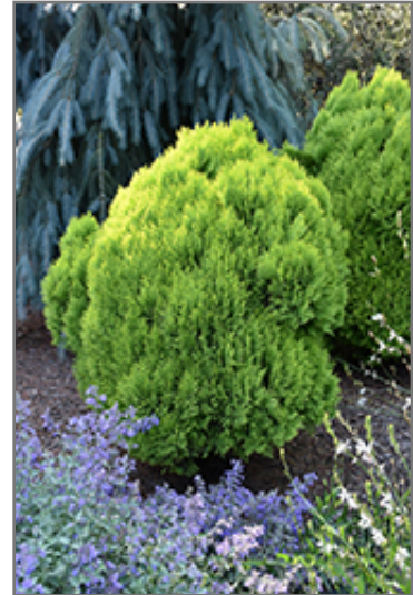
Morgan Oriental Arborvitae