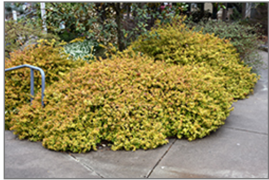
Kaleidoscope Abelia

Kaleidoscope Abelia will grow to be about 30 inches tall at maturity, with a spread of 4 feet. It tends to fill out right to the ground and therefore doesn't necessarily require facer plants in front. It grows at a slow rate, and under ideal conditions can be expected to live for approximately 30 years.