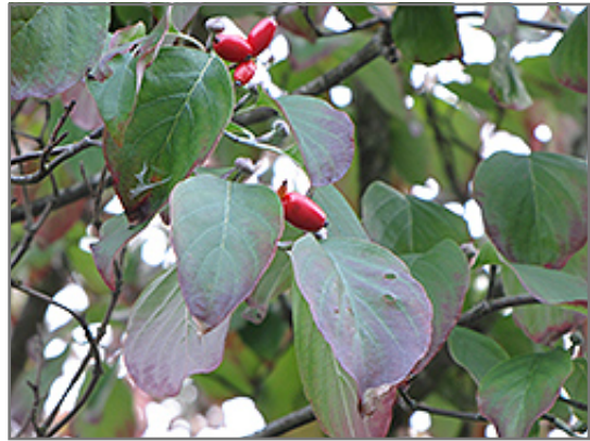
Cherokee Chief Flowering Dogwood fruit

This tree does best in full sun to partial shade. You may want to keep it away from hot, dry locations that receive direct afternoon sun or which get reflected sunlight, such as against the south side of a white wall. It requires an evenly moist well-drained soil for optimal growth, but will die in standing water. It is very fussy about its soil conditions and must have rich, acidic soils to ensure success, and is subject to chlorosis (yellowing) of the foliage in alkaline soils. It is quite intolerant of urban pollution, therefore inner city or urban streetside plantings are best avoided, and will benefit from being planted in a relatively sheltered location. Consider applying a thick mulch around the root zone in winter to protect it in exposed locations or colder microclimates. This is a selection of a native North American species.