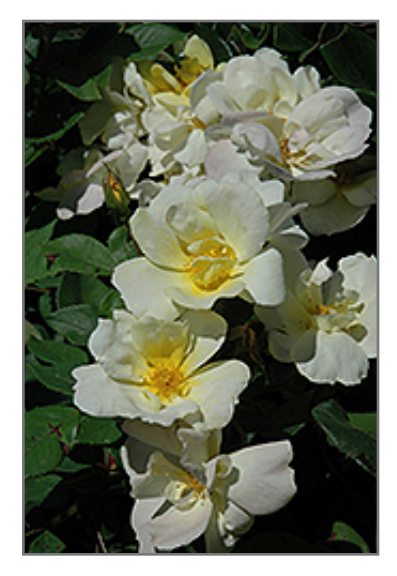
Sunny Knock Out Rose flowers

2608 Hikes Lane Louisville, KY 40218 (502) 454-3553