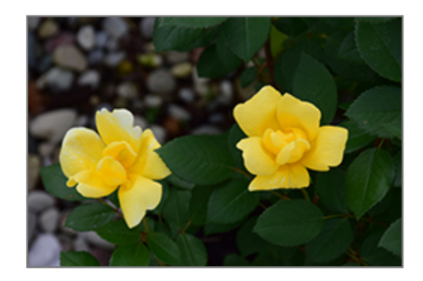
Sunny Knock Out Rose flowers