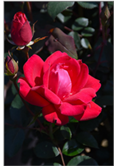
Double Knock Out Rose flowers

Double Knock Out Rose is recommended for the following landscape applications;