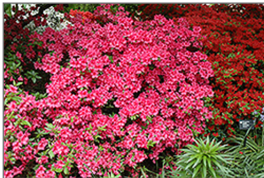
Girard's Rose Azalea in bloom