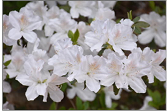
Delaware Valley White Azalea flowers