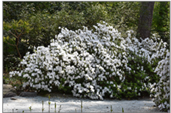
Delaware Valley White Azalea in bloom