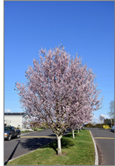
Krauter Vesuvius Plum in bloom