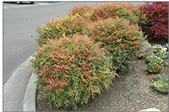
Sienna Sunrise Nandina