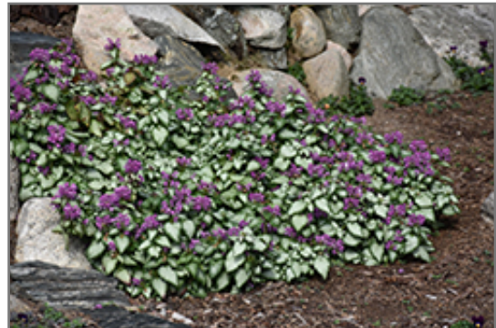
Purple Dragon Spotted Dead Nettle in bloom