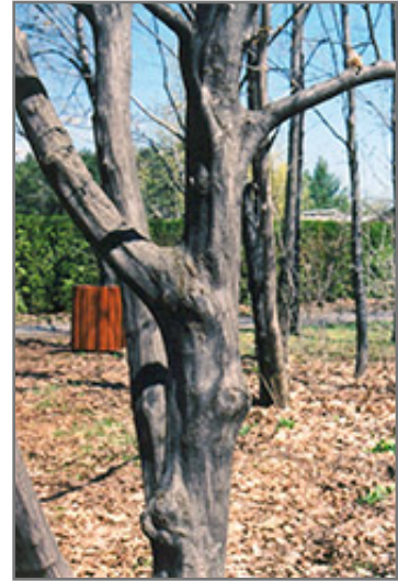
American Hornbeam bark

This tree performs well in both full sun and full shade. It is an amazingly adaptable plant, tolerating both dry conditions and even some standing water. It is not particular as to soil type or pH. It is somewhat tolerant of urban pollution. This species is native to parts of North America.