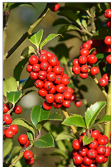
Castle Spire Meserve Holly fruit