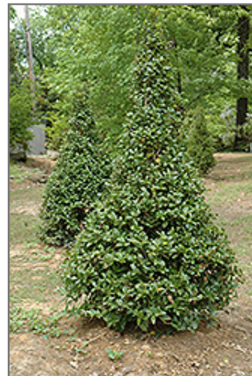
Castle Spire Meserve Holly