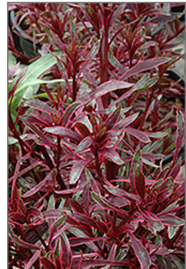
Passionate Rainbow Gaura foliage