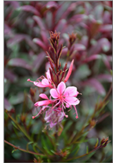
Passionate Rainbow Gaura flowers

Passionate Rainbow Gaura is recommended for the following landscape applications;