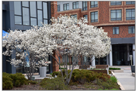
Autumn Brilliance Serviceberry in bloom

Autumn Brilliance Serviceberry is recommended for the following landscape applications;