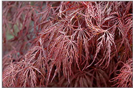
Crimson Queen Japanese Maple foliage

Crimson Queen Japanese Maple is recommended for the following landscape applications;