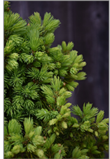
Rainbow's End Spruce foliage

This shrub should only be grown in full sunlight. It prefers to grow in average to moist conditions, and shouldn't be allowed to dry out. It is not particular as to soil type or pH. It is somewhat tolerant of urban pollution, and will benefit from being planted in a relatively sheltered location. This is a selection of a native North American species.