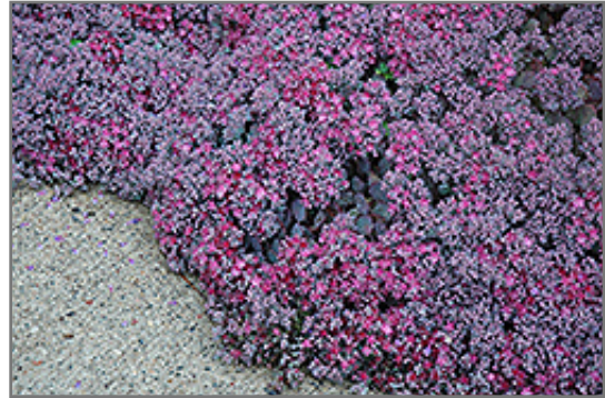
Lidakense Stonecrop in bloom