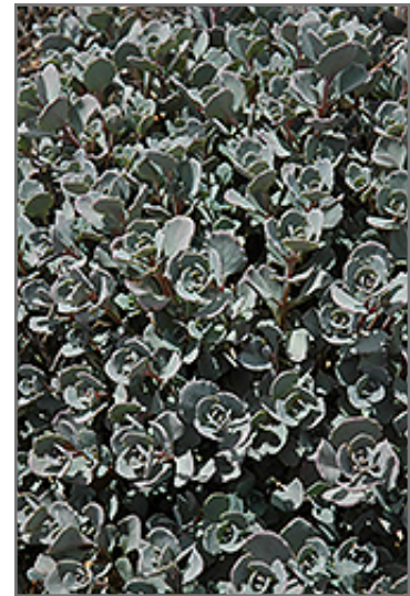
Lidakense Stonecrop foliage