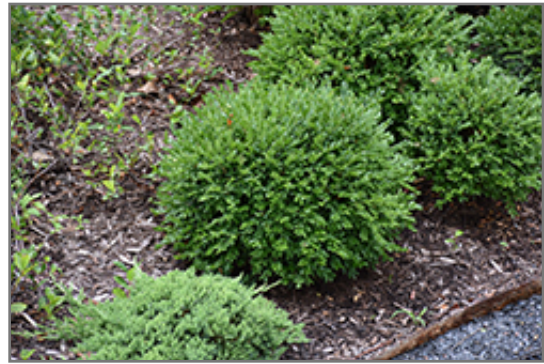
NewGen Liberty Belle Boxwood

NewGen Liberty Belle Boxwood is recommended for the following landscape applications;