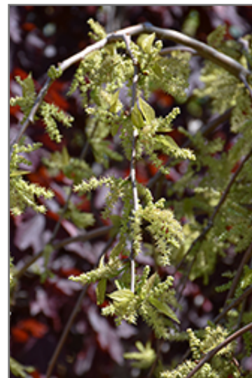
Chaparral Weeping Mulberry flowers