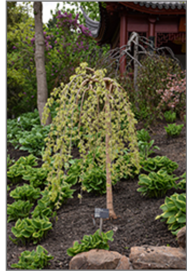
Chaparral Weeping Mulberry in bloom

This shrub performs well in both full sun and full shade. It is very adaptable to both dry and moist locations, and should do just fine under average home landscape conditions. It is considered to be drought-tolerant, and thus makes an ideal choice for xeriscaping or the moisture-conserving landscape. It is not particular as to soil type or pH, and is able to handle environmental salt. It is highly tolerant of urban pollution and will even thrive in inner city environments. This is a selected variety of a species not originally from North America.