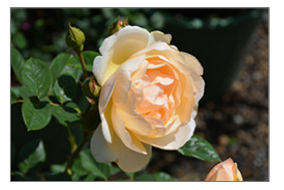
Wollerton Old Hall English Climbing Rose flowers

Wollerton Old Hall English Climbing Rose features showy lightly-scented fully double peach flowers with buttery yellow eyes along the branches from late spring to early fall. The flowers are excellent for cutting. It has dark green deciduous foliage. The glossy oval compound leaves do not develop any appreciable fall color.