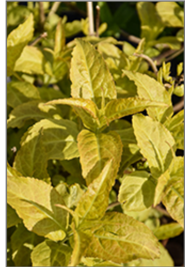
Firefly Diervilla foliage

Firefly Diervilla makes a fine choice for the outdoor landscape, but it is also well-suited for use in outdoor pots and containers. Because of its height, it is often used as a 'thriller' in the 'spiller-thriller-filler' container combination; plant it near the center of the pot, surrounded by smaller plants and those that spill over the edges. It is even sizeable enough that it can be grown alone in a suitable container. Note that when grown in a container, it may not perform exactly as indicated on the tag - this is to be expected. Also note that when growing plants in outdoor containers and baskets, they may require more frequent waterings than they would in the yard or garden.