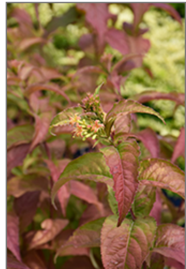
Firefly Diervilla flowers