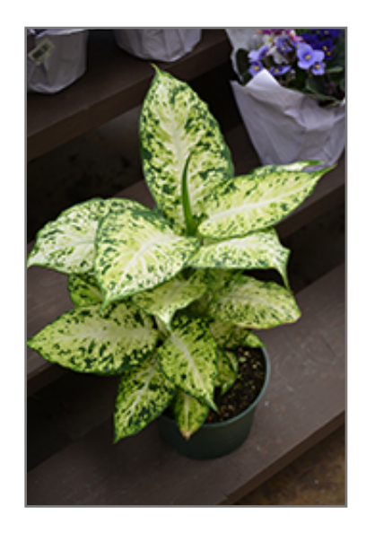
Amy Dieffenbachia in full

2608 Hikes Lane Louisville, KY 40218 (502) 454-3553