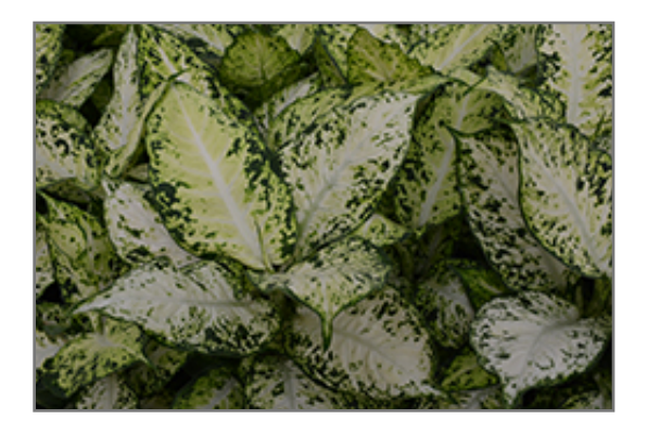
Amy Dieffenbachia foliage

This is an herbaceous evergreen houseplant with an upright spreading habit of growth. Its relatively coarse texture stands it apart from other indoor plants with finer foliage. This plant should not require much pruning, except when necessary to keep it looking its best.