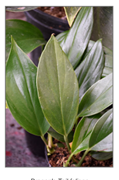
Dragon's Tail foliage

When grown indoors, Dragon's Tail can be expected to grow to be about 6 feet tall at maturity, with a spread of 24 inches. It grows at a fast rate, and under ideal conditions can be expected to live for approximately 10 years. This houseplant performs well in both bright or indirect sunlight and strong artificial light, and can therefore be situated in almost any well-lit room or location. It does best in average to evenly moist soil, but will not tolerate standing water. The surface of the soil shouldn't be allowed to dry out completely, and so you should expect to water this plant once and possibly even twice each week. Be aware that your particular watering schedule may vary depending on its location in the room, the pot size, plant size and other conditions; if in doubt, ask one of our experts in the store for advice. It is not particular as to soil pH, but grows best in rich soil. Contact the store for specific recommendations on pre-mixed potting soil for this plant. Be warned that parts of this plant are known to be toxic to humans and animals, so special care should be exercised if growing it around children and pets.