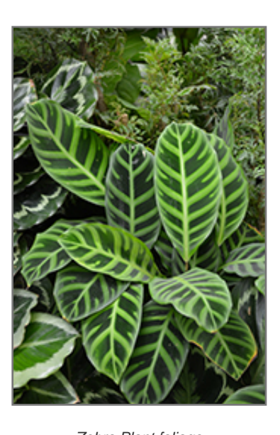
Zebra Plant foliage

When grown indoors, Zebra Plant can be expected to grow to be about 3 feet tall at maturity, with a spread of 24 inches. It grows at a slow rate, and under ideal conditions can be expected to live for approximately 5 years. This houseplant should only be grown away from direct sunlight or in a room with strong artificial light. It does best in average to evenly moist soil, but will not tolerate standing water. The surface of the soil shouldn't be allowed to dry out completely, and so you should expect to water this plant once and possibly even twice each week. Be aware that your particular watering schedule may vary depending on its location in the room, the pot size, plant size and other conditions; if in doubt, ask one of our experts in the store for advice. It will benefit from a regular feeding with a general-purpose fertilizer with every second or third watering. It is not particular as to soil pH, but grows best in rich soil. Contact the store for specific recommendations on pre-mixed potting soil for this plant.