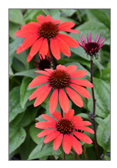
Panama Red Coneflower flowers