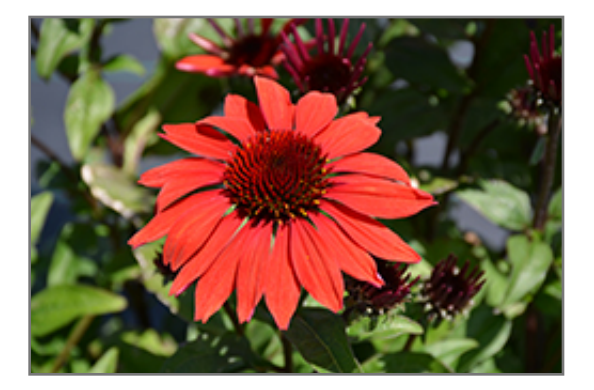
Panama Red Coneflower flowers

2608 Hikes Lane Louisville, KY 40218 (502) 454-3553