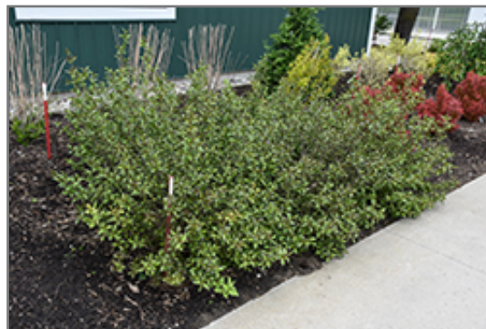
Vinho Verde Weigela