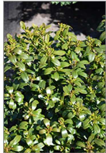
Strongbox Inkberry Holly foliage