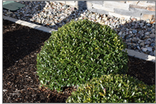
Strongbox Inkberry Holly

Strongbox Inkberry Holly is recommended for the following landscape applications;