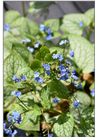
Jack of Diamonds Bugloss flowers

Jack of Diamonds Bugloss is recommended for the following landscape applications;