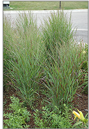
Shenandoah Reed Switch Grass