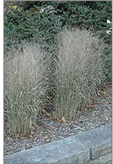
Shenandoah Reed Switch Grass in fall

This plant does best in full sun to partial shade. It is very adaptable to both dry and moist locations, and should do just fine under typical garden conditions. It is considered to be drought-tolerant, and thus makes an ideal choice for a low-water garden or xeriscape application. It is not particular as to soil type, but has a definite preference for alkaline soils, and is able to handle environmental salt. It is somewhat tolerant of urban pollution. This is a selection of a native North American species. It can be propagated by division; however, as a cultivated variety, be aware that it may be subject to certain restrictions or prohibitions on propagation.