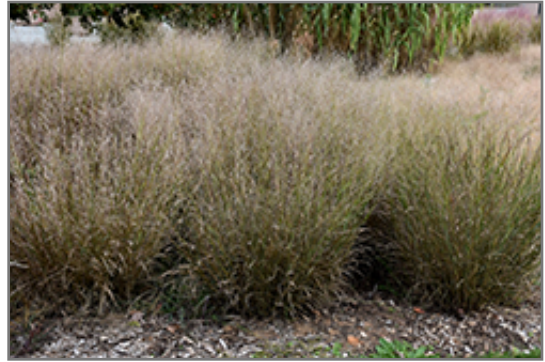
Shenandoah Reed Switch Grass fruit