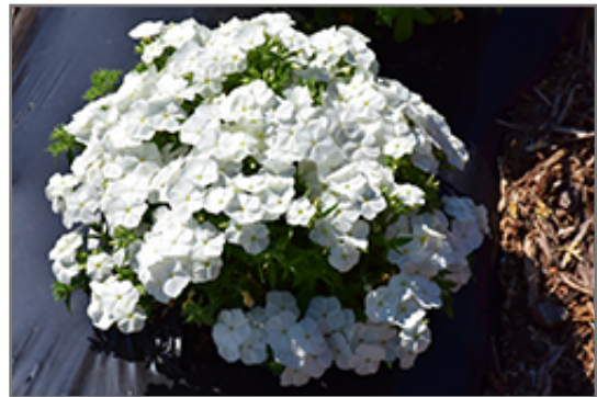
Gisele White Phlox in bloom