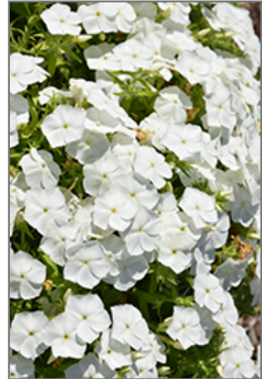
Gisele White Phlox flowers

Gisele White Phlox is recommended for the following landscape applications;