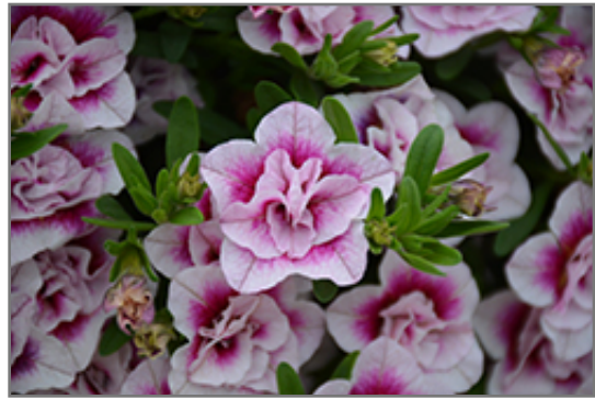
MiniFamous Uno Double PinkTastic Calibrachoa flowers

MiniFamous Uno Double PinkTastic Calibrachoa is a dense herbaceous annual with a trailing habit of growth, eventually spilling over the edges of hanging baskets and containers. Its medium texture blends into the garden, but can always be balanced by a couple of finer or coarser plants for an effective composition.