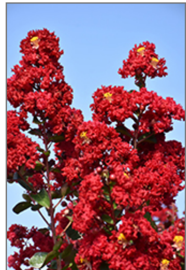
Double Dynamite Crapemyrtle flowers