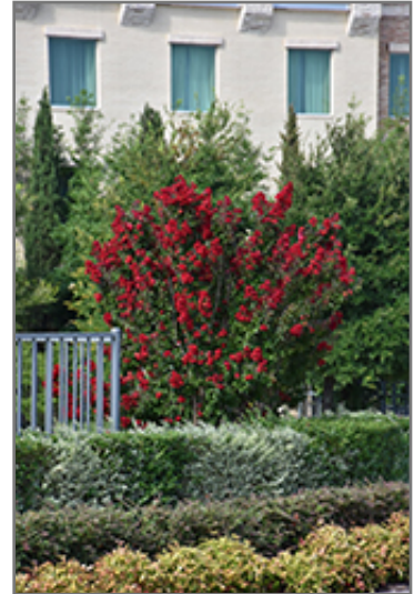
Double Dynamite Crapemyrtle in bloom

This shrub does best in full sun to partial shade. It prefers to grow in average to moist conditions, and shouldn't be allowed to dry out. It is very fussy about its soil conditions and must have rich, acidic soils to ensure success, and is subject to chlorosis (yellowing) of the foliage in alkaline soils. It is highly tolerant of urban pollution and will even thrive in inner city environments. This is a selected variety of a species not originally from North America.