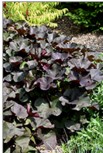
Britt Marie Crawford Rayflower foliage

This plant does best in partial shade to shade. It prefers to grow in moist to wet soil, and will even tolerate some standing water. It is not particular as to soil pH, but grows best in rich soils. It is somewhat tolerant of urban pollution. This is a selected variety of a species not originally from North America. It can be propagated by division; however, as a cultivated variety, be aware that it may be subject to certain restrictions or prohibitions on propagation.