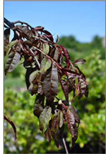
Crimson Cascade Weeping Peach foliage

This tree should only be grown in full sunlight. It does best in average to evenly moist conditions, but will not tolerate standing water. It is not particular as to soil type or pH. It is highly tolerant of urban pollution and will even thrive in inner city environments, and will benefit from being planted in a relatively sheltered location. This is a selected variety of a species not originally from North America.