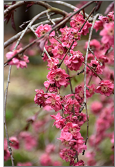
Crimson Cascade Weeping Peach flowers

Crimson Cascade Weeping Peach is recommended for the following landscape applications;