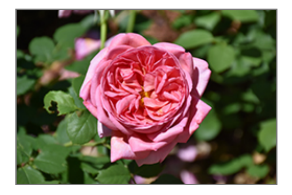
Boscobel Rose flowers

2608 Hikes Lane Louisville, KY 40218 (502) 454-3553