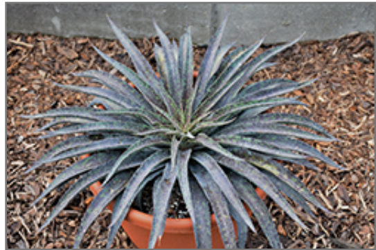
Inkblot Mangave