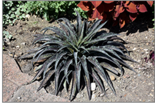
Inkblot Mangave

Inkblot Mangave is recommended for the following landscape applications;