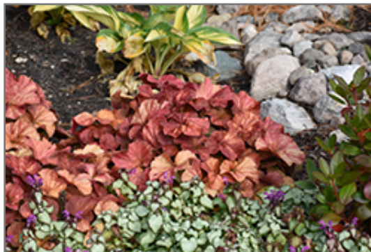
Northern Exposure Amber Coral Bells

Northern Exposure Amber Coral Bells is a fine choice for the garden, but it is also a good selection for planting in outdoor pots and containers. It is often used as a 'filler' in the 'spiller-thriller-filler' container combination, providing a mass of flowers and foliage against which the larger thriller plants stand out. Note that when growing plants in outdoor containers and baskets, they may require more frequent waterings than they would in the yard or garden.