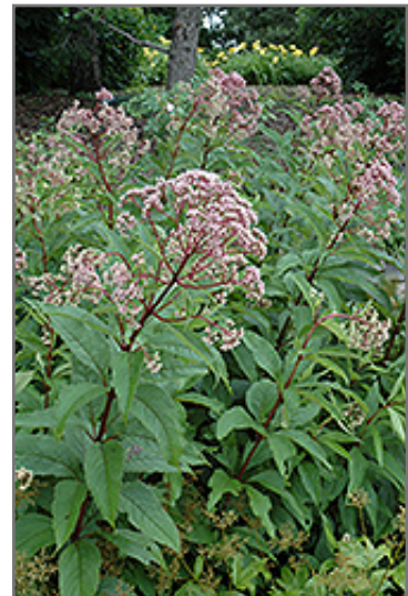
Gateway Joe Pye Weed flowers