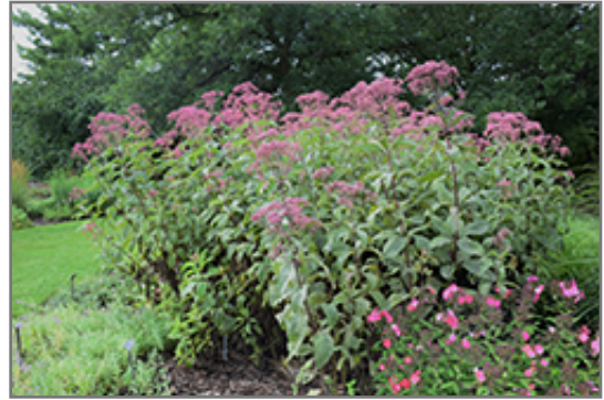
Gateway Joe Pye Weed in bloom