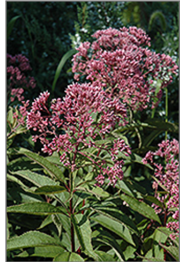
Gateway Joe Pye Weed flower buds

Gateway Joe Pye Weed is an herbaceous perennial with an upright spreading habit of growth. Its wonderfully bold, coarse texture can be very effective in a balanced garden composition.