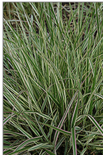
Variegated Reed Grass foliage