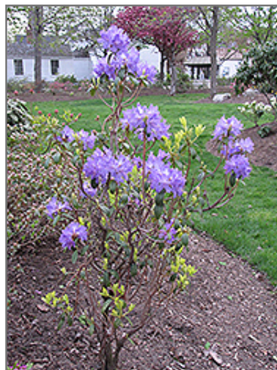
Blue Baron Rhododendron in bloom

This shrub does best in full sun to partial shade. You may want to keep it away from hot, dry locations that receive direct afternoon sun or which get reflected sunlight, such as against the south side of a white wall. It requires an evenly moist well-drained soil for optimal growth, but will die in standing water. It is very fussy about its soil conditions and must have rich, acidic soils to ensure success, and is subject to chlorosis (yellowing) of the foliage in alkaline soils. It is somewhat tolerant of urban pollution, and will benefit from being planted in a relatively sheltered location. Consider applying a thick mulch around the root zone in winter to protect it in exposed locations or colder microclimates. This particular variety is an interspecific hybrid.