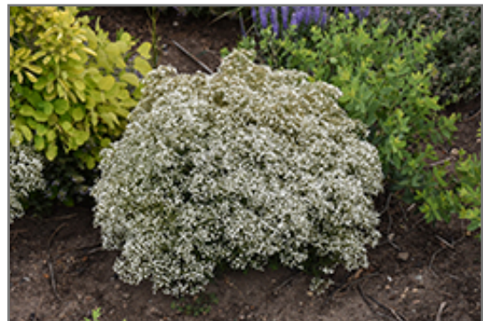
Summer Sparkles Baby's Breath in bloom