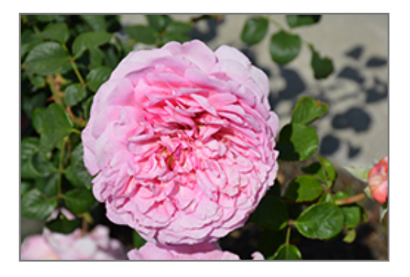
Princess Alexandra Of Kent Rose flowers

This is a high maintenance shrub that will require regular care and upkeep, and is best pruned in late winter once the threat of extreme cold has passed. Gardeners should be aware of the following characteristic(s) that may warrant special consideration;