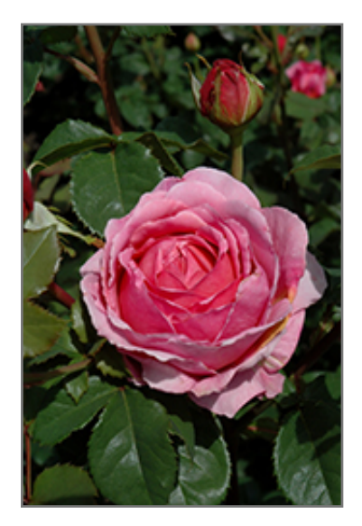
Princess Alexandra Of Kent Rose flowers

2608 Hikes Lane Louisville, KY 40218 (502) 454-3553