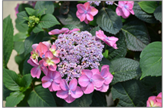
Tuff Stuff Hydrangea flowers

Tuff Stuff Hydrangea makes a fine choice for the outdoor landscape, but it is also well-suited for use in outdoor pots and containers. With its upright habit of growth, it is best suited for use as a 'thriller' in the 'spiller-thriller-filler' container combination; plant it near the center of the pot, surrounded by smaller plants and those that spill over the edges. It is even sizeable enough that it can be grown alone in a suitable container. Note that when grown in a container, it may not perform exactly as indicated on the tag - this is to be expected. Also note that when growing plants in outdoor containers and baskets, they may require more frequent waterings than they would in the yard or garden.