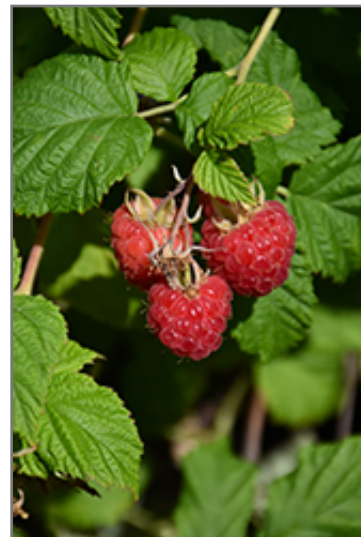
Raspberry Shortcake Raspberry fruit

Raspberry Shortcake Raspberry has rich green deciduous foliage on a plant with an upright spreading habit of growth. The textured oval compound leaves do not develop any appreciable fall color. It features an abundance of magnificent red berries in mid summer.