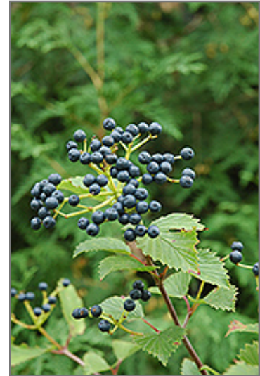
Blue Muffin Viburnum fruit

Blue Muffin Viburnum is recommended for the following landscape applications;