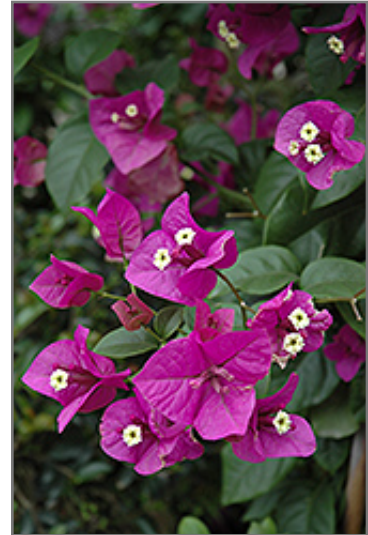
Purple Queen Bougainvillea flowers