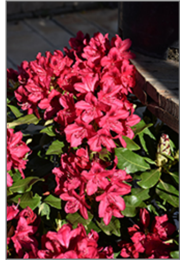
Nova Zembla Rhododendron flowers

This shrub does best in full sun to partial shade. You may want to keep it away from hot, dry locations that receive direct afternoon sun or which get reflected sunlight, such as against the south side of a white wall. It requires an evenly moist well-drained soil for optimal growth, but will die in standing water. It is very fussy about its soil conditions and must have rich, acidic soils to ensure success, and is subject to chlorosis (yellowing) of the foliage in alkaline soils. It is somewhat tolerant of urban pollution, and will benefit from being planted in a relatively sheltered location. Consider applying a thick mulch around the root zone in winter to protect it in exposed locations or colder microclimates. This particular variety is an interspecific hybrid.