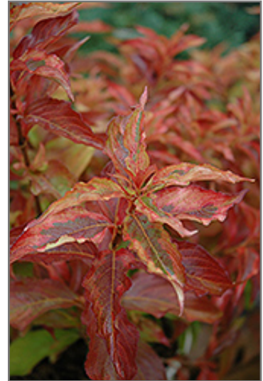
My Monet Sunset Weigela in fall

My Monet Sunset Weigela makes a fine choice for the outdoor landscape, but it is also well-suited for use in outdoor pots and containers. It is often used as a 'filler' in the 'spiller-thriller-filler' container combination, providing a mass of flowers and foliage against which the thriller plants stand out. Note that when grown in a container, it may not perform exactly as indicated on the tag - this is to be expected. Also note that when growing plants in outdoor containers and baskets, they may require more frequent waterings than they would in the yard or garden.