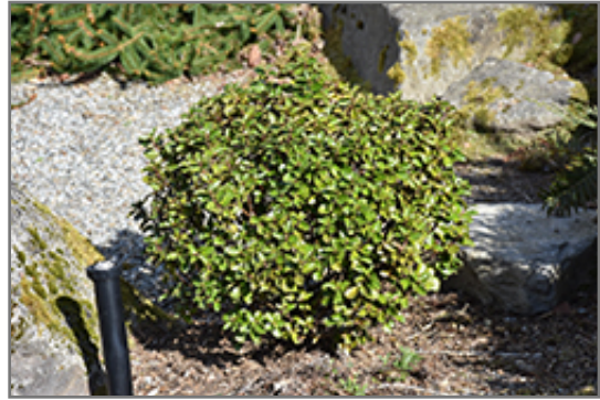
Little Rascal Meserve Holly