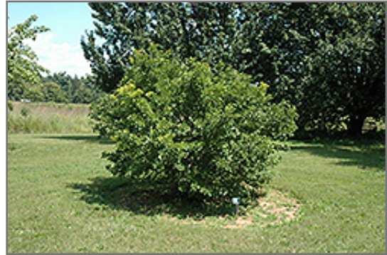
Jade Butterflies Ginkgo

Jade Butterflies Ginkgo is recommended for the following landscape applications;